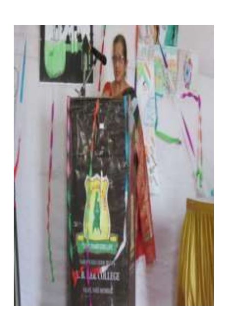
Speech by President of Sainath Education Trust