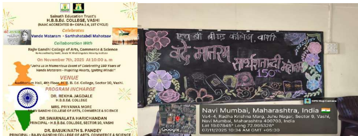
Invitation card for the event

The grand finale featured the melodious presentation of “Mile Sur Mera Tumhara”, symbolizing the harmony and unity of India’s linguistic and cultural diversity. The audience joined in with great enthusiasm, creating a truly memorable moment of shared pride and joy.