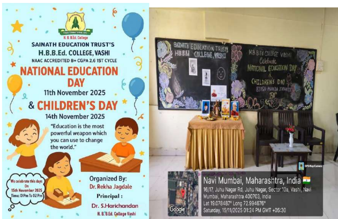
Invitation Card of the event

The programme received positive feedback from students, teachers, and guests. They appreciated the performances, informative speeches, and the discipline maintained throughout the event.