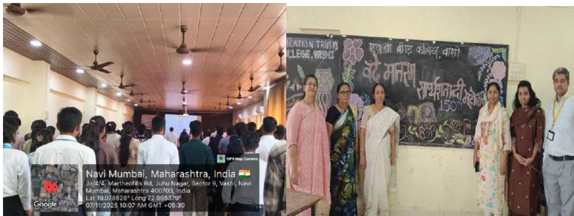
Photos of the event